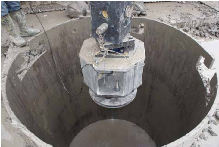
Insertion of SQUID by drill rig into the bore hole